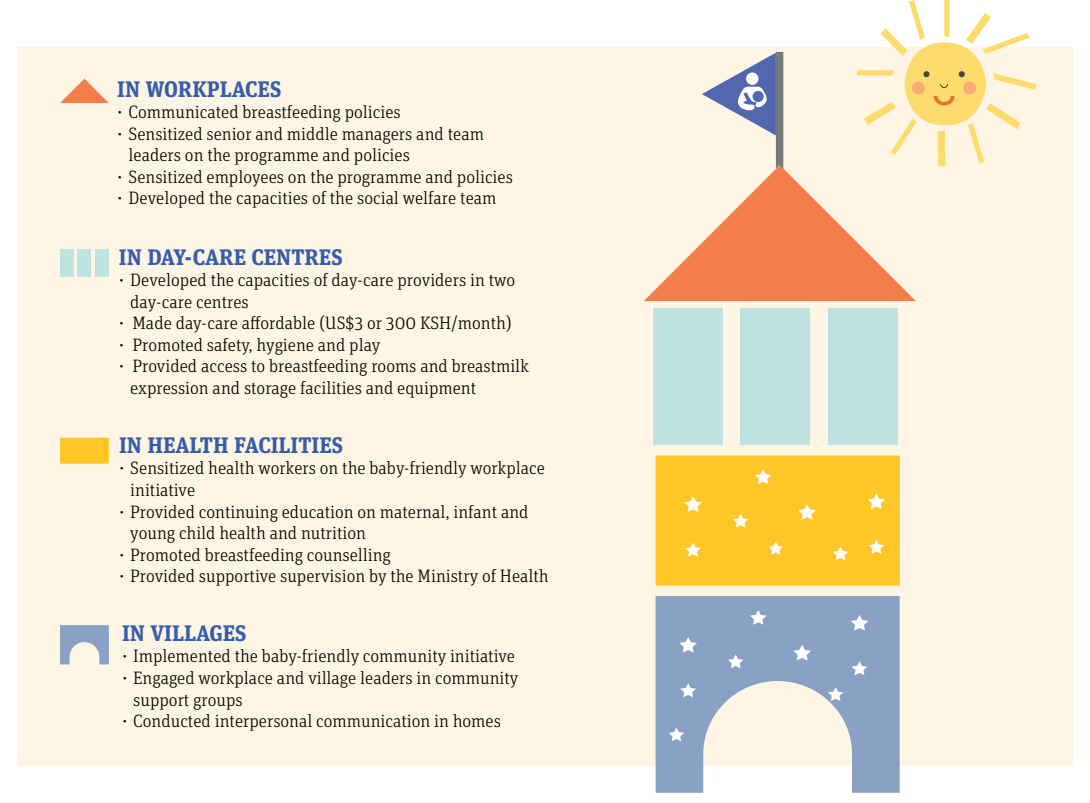
Figure 1. Components of the baby-friendly workplace initiative

As shown in Figure 1,170 the field activities were implemented through four distinct channels, with messages delivered to mothers and other key influencers. The four channels included: the workplace, day-care centres, health facilities, and villages. Specific activities undertaken for each of these four channels are also shown in the diagram above. In addition to supporting breastfeeding, the messages covered related aspects of optimal complementary