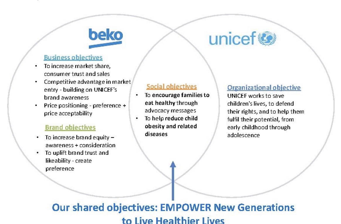
Figure 1: Shared objectives between Beko and UNICEF

UNICEF instead suggested a massive 'call to action' social media fundraising campaign around the theme of Eat Like a Pro to be launched at the time of the El Clásico match in May 2018.<sup>281</sup> The rationale was that this would create energy around the prevention of childhood overweight and obesity, have immense outreach considering FCB's vast fan base and social media footprint, and rapidly secure funding for UNICEF. Beko agreed and plans were put in motion.