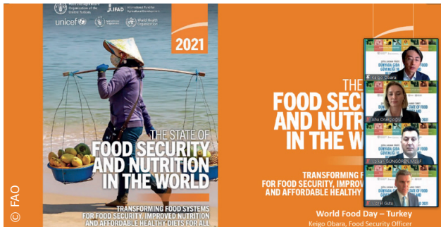
FAO Turkey Team at Virtual Launch of The State of Food Security and Nutrition in the World 2021 (SOFI 2021).