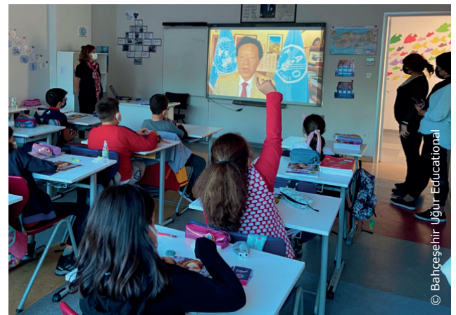
Students asked questions to FAO Director-General Qu Dongyu.

A Junior World Food Day Event was organized to raise awareness among younger generations about the agrifood systems. FAO Director-General Qu Dongyu participated in an online event with students of Bahçeşehir Uğur Educational Institutions, and answered their questions.